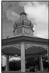
Old-world charm meets suburban progress in downtown Boerne