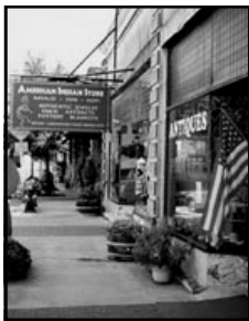
Many residents find the slower pace of life in a small town attractive.

“We want to demonstrate to a watching world the kindness of God which leads to repentance.”